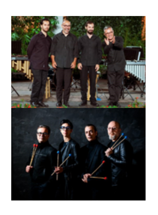
28 July PERCUSSION lecturer: Teatro alla Scala Percussionists and Tetraktis Percussioni